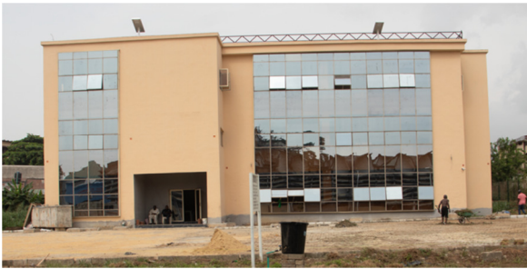
Fig. 2. Ground view of the study area.

The selected building structure of focus in this study was the National Centre for Energy Efficiency & Conservation Building (Figure 2), which is part of the University of Lagos. This building is situated along Oduduwa Drive, within the University of Lagos, Akoka, in the Lagos Mainland Local Government Area of Lagos State, Nigeria. The geographical coordinates of this location fall between latitudes 6^{\circ}30'N to 6^{\circ}31'N and longitudes 3^{\circ}25'E to 3^{\circ}27'E . The structure stands at approximately 16 m height. Despite being in existence for a few years, it was only recently commissioned for use due to some observed deformations. Remedial measures have been implemented to ensure its stability. However, this study aims to conduct ongoing monitoring of the building's structural health and evaluate the effectiveness of the implemented remedial measures.